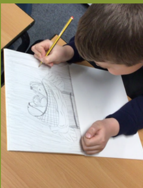
ART - STILL LIFE