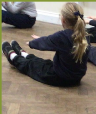
SHAPE POSES IN GYMNASTICS