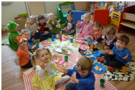
Mad Hatters Tea Party in Nursery

Thankfully the snow had blown away by Thursday morning and the children could really enjoy sharing their colourful book character costumes.